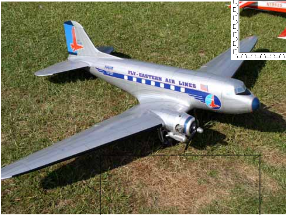
RIVER DISTRICT R/C EAGLES EAGLES' NEST Visit us on the web at http://notgrownupyet.com/eagles/ AUGUST, 25 2006 ISSUE