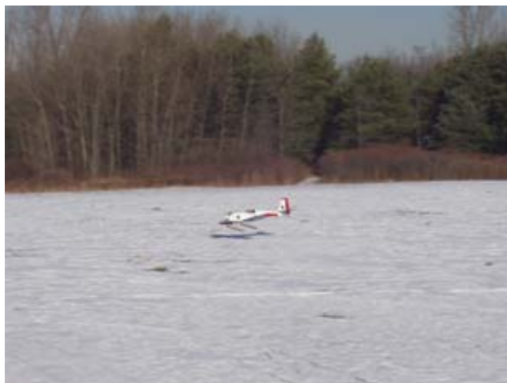
....and a safe landing 12/11/02