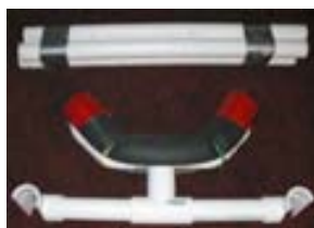
Short legs &