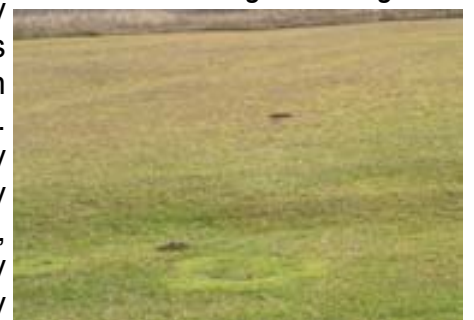
View of "ditch", on west end of field

humble opinion that they may have their eyes set on moving in our flight area. Moles generally tunnel where they find food (grubs), and while this may be an opportunity