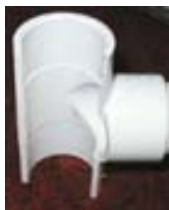
Tee cut to fit