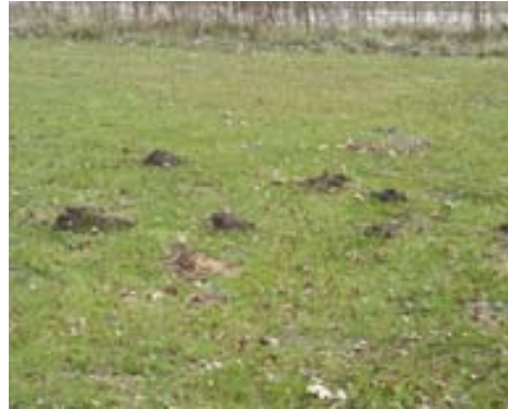
Mole hills near the front gate

I am sure everyone has become familiar, or at least noticed the mole hills in the small clearing near the