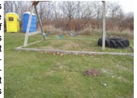
Moles invading the swing

a couple of mounds near the flight line on the west end of the field. Perhaps the moles just want to get a better view of the flying activities, but it is this authors